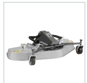
Rotary/mulch mower 1500