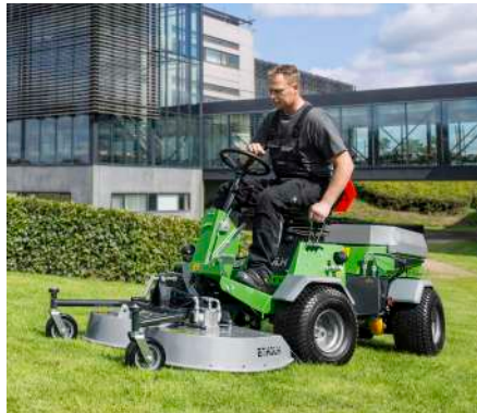
Rotary/mulch mower 1200