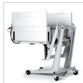
Load carrier with tip