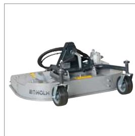
Rotary, mulch or collection mower 1000