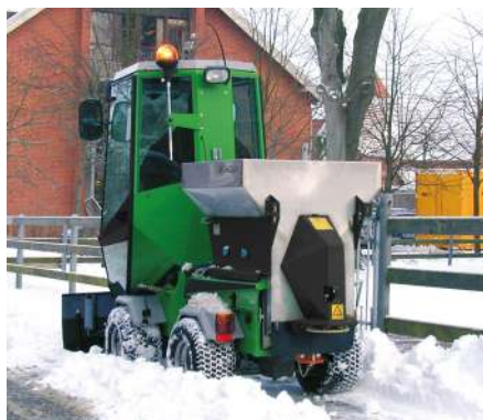
Salt and sand spreader