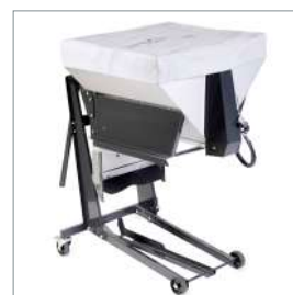
Salt and sand spreader