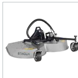
Rotary/mulch mower 1200