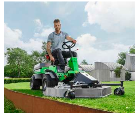
Rotary/mulch mower 1500