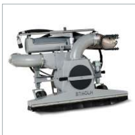
Leaf suction unit