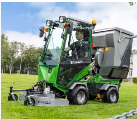
Rotary/mulch mower 1000 with grass collector